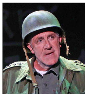
General Henry Waverly